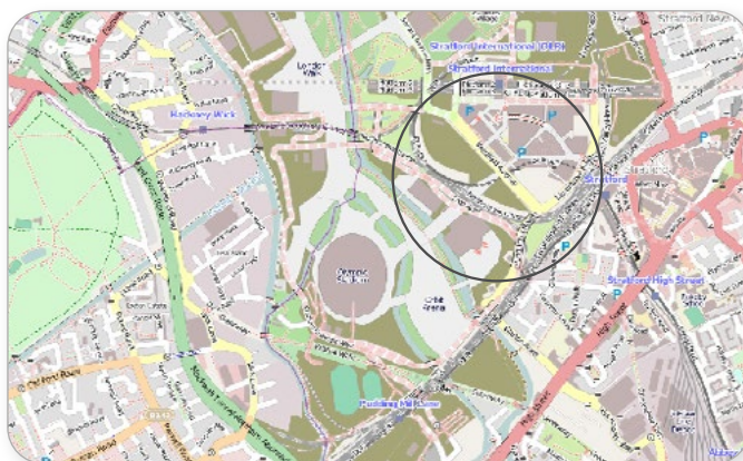
Map data: OpenStreetMap | ODbL 1.0 , Tiles CC-BY-SA 2.0

Thanks to geofence, each building site can be given a cost centre number, or another designation, which is then included in all reports automatically.